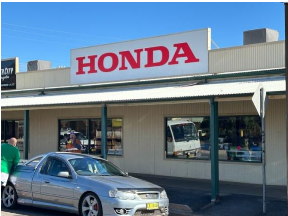
Similar new building in Broken Hill in Oxide Street