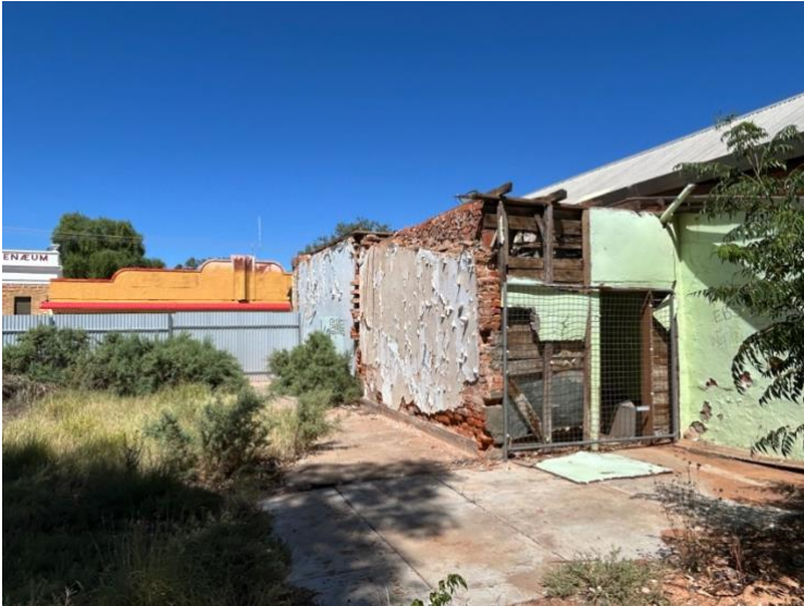
Rear of building section to be demolished.