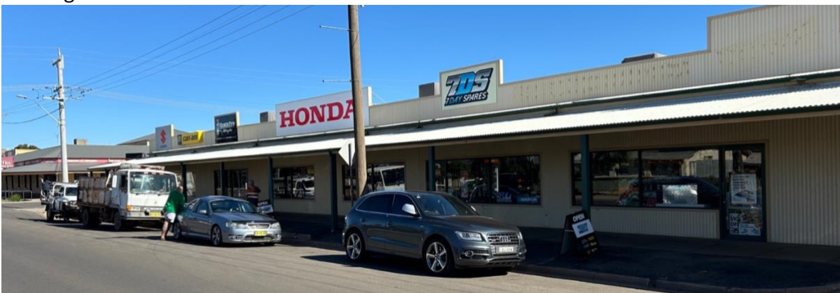
Similar building in Oxide Street, Broken Hill, but longer