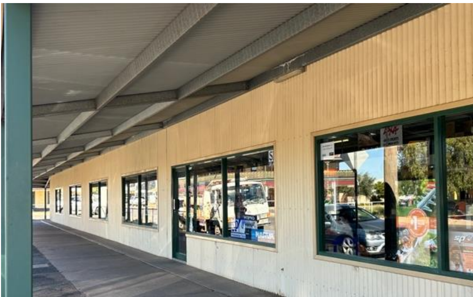
Simple shop front in new building in Broken Hill. Could also be constructed in masonry block eg hebel block.