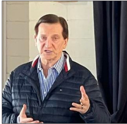
Minister for Local Government, Ron Hoenig MP speaking about the future for Central Darling Shire.

In July 2024 the NSW Government announced plans to bring Central Darling Shire Council out of Administration. As part of the process the NSW Government will introduce a new council model. Central Darling Shire will become a 'Rural and Remote Council' made up of three locally elected councillors from the community and three councillors appointed by the NSW Government with relevant expertise to support the stable and effective operation of the Council.