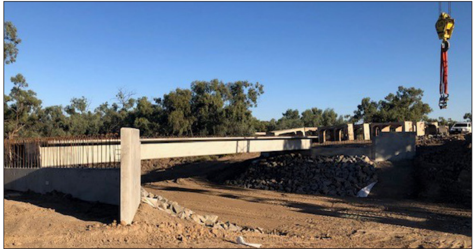
Work has been occurring on the bridge at Yampoola crossing.

As part of the recent works construction has been occurring on the bridge at Yampoola Crossing. In the latest update to Council 54 kilometres of the road project have now been sealed. The Pooncarie Road project will see 61 kilometres of road sealed between Menindee and Pooncarie. It is a $39.6 million project with the Federal government having committed $27.1 million and the State government $12.5 million.